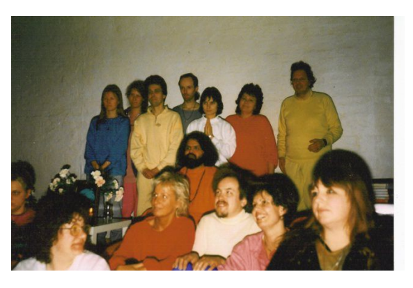
Yoga-Seminar with Swamiji at Falkenried