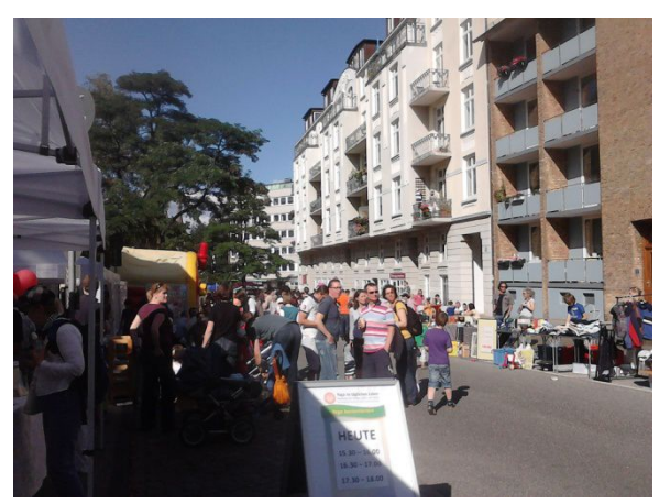
Yoga in Daily Life on one road festival