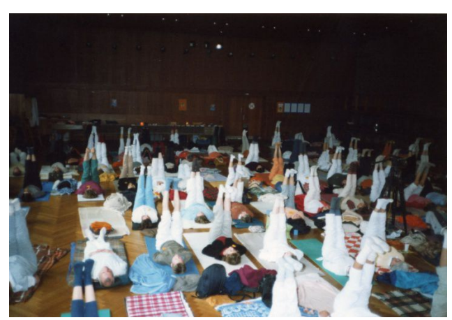
Yoga-Seminar in Hamburg