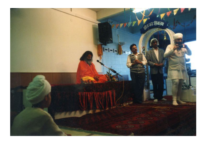
Visit to Ashram Hamburg