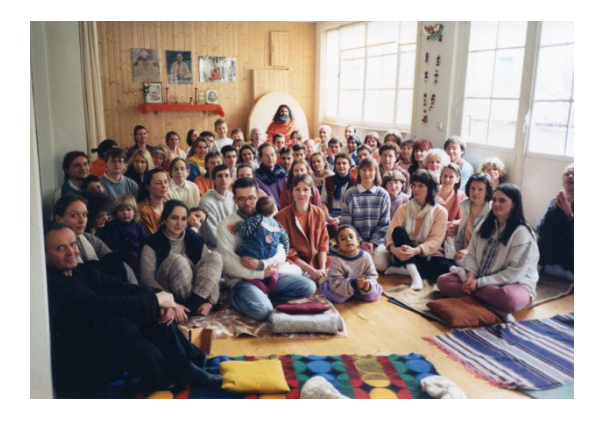
Yoga group in the first Hamburg Ashram