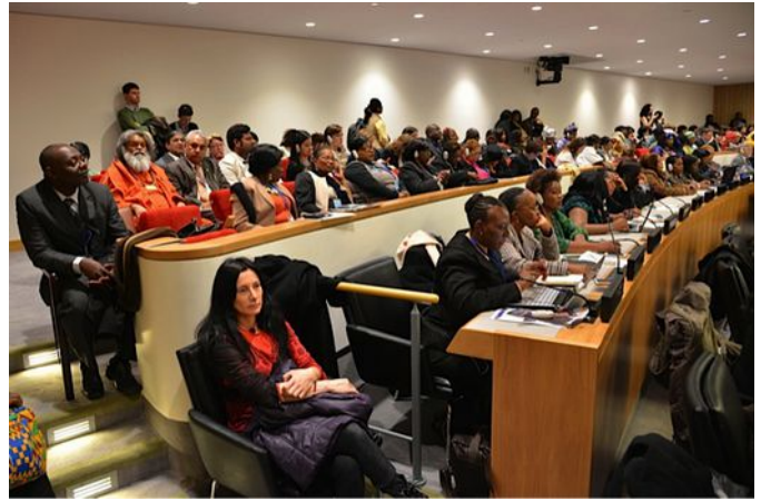
Swamiji attending the UN CSW58 Conference on behalf of SMWPC, accompanied by numerous representatives of SMWPC, YIDL US and YIDL AUS, March 2014, UN headquarters in NY.

Since 2003 Swamiji has planted more that 90 Peace Trees in over 20 countries spreading message of peace and tolerance among religions, cultures and nations and reminding people of their unity with nature and the environment. Joining in this initiative, several Peace Trees have been planted in the U.S.,