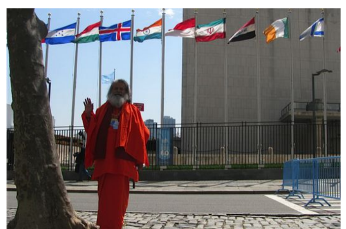
Swamini's Blessings for a peaceful and harmonious life and sustainable future from the UN headquarters in NY, 2013.