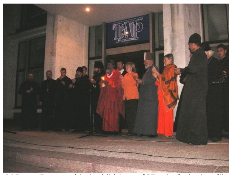
World Peace Prayer with Archibishop of Ukrain Orthodox Church