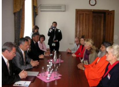
Meeting with Governor