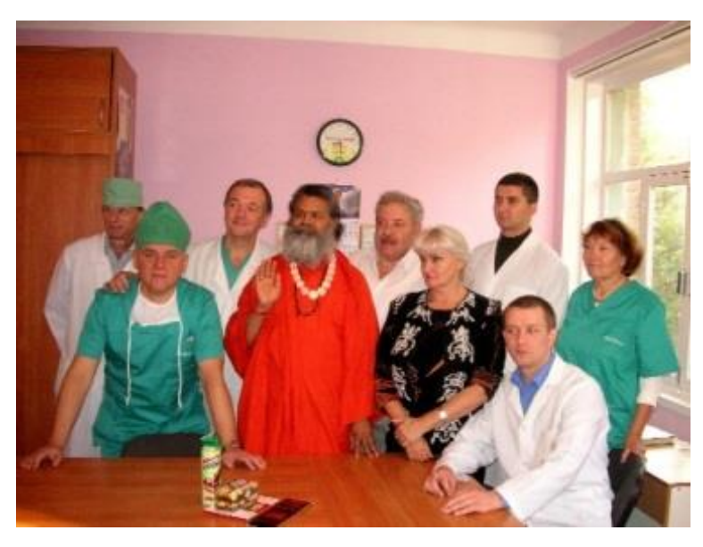
So, in Cherkassy this system is used in rehabilitation and healthcare center "Astra" for rehabilitation of disabled people, Chernobyl liquidators, peacekeepers, people after myocardial infarction, stroke, people with spinal or limbs injury, women after mastectomy, children with infantile cerebral paralysis, etc. (photo: Swamiji with doctors and nurses of City Hospital Cherkassy)