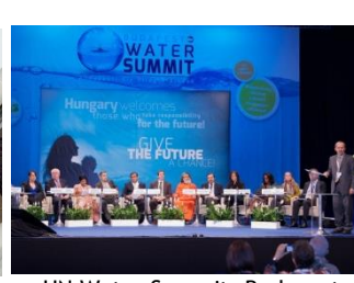
UN Water Summit, Budapest